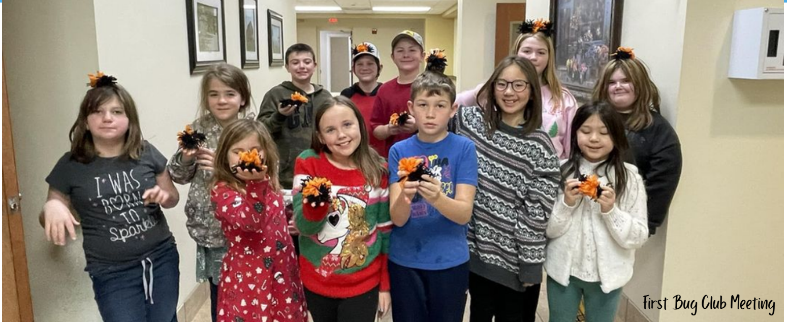
First Bug Club Meeting