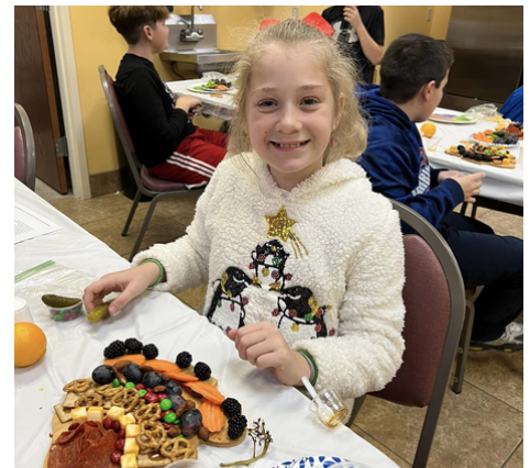
Holiday Charcuterie Boards