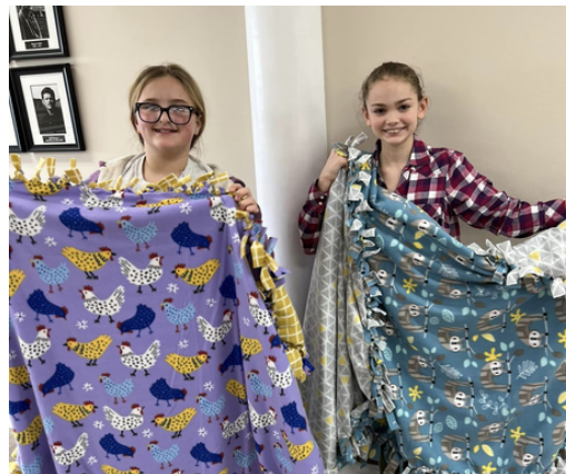
No Sew Blanket Class