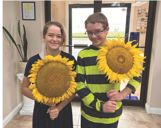
4-H Sunflower Contest