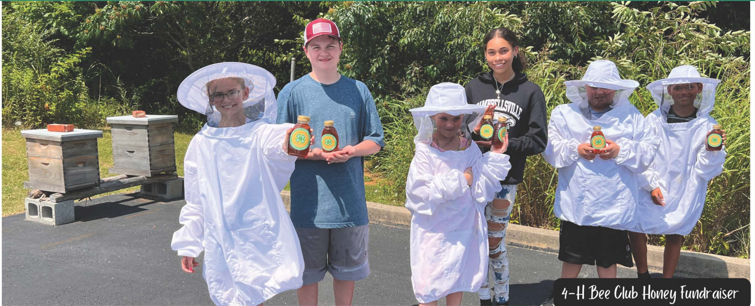
4-H Bee Club Honey Fundraiser