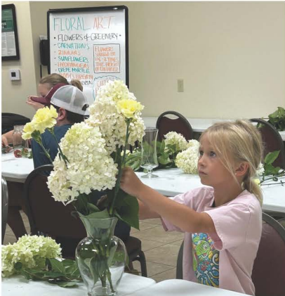
Floral Design Class